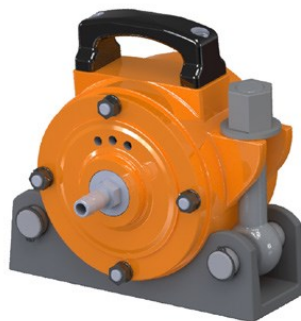
NTV 20-4 with Bracket NVH 4